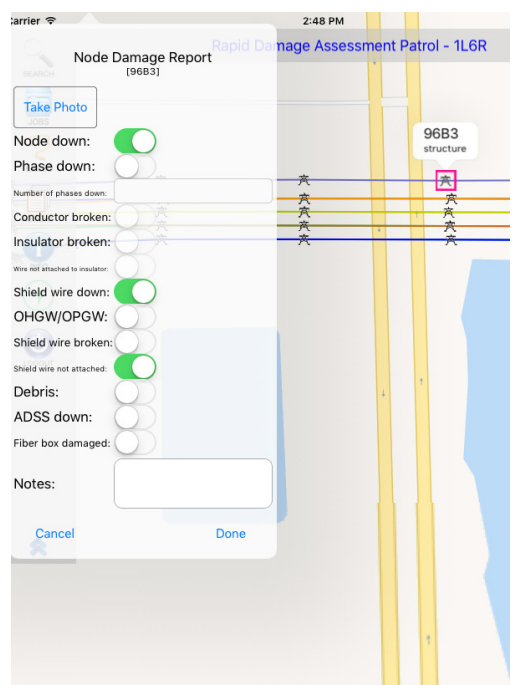
Inspection data is entered on a map with utility infrastructure overlay

If an inspector identifies needed repairs, the application allows them to simply create a new job, tagged with the location. Once a site report is complete, it is immediately sent to the dashboard and the corporate WMS system. Additionally, the data needed for the repair work is sent along with the job. In remote areas where there may be poor or no connectivity, the report will be saved until a network connection is found, allowing inspectors to continue to the next area without interruption.